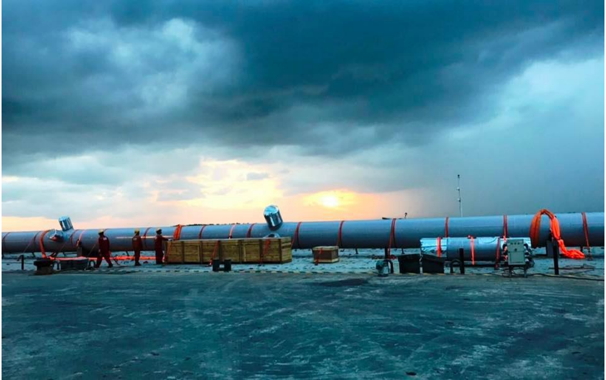
Super-duplex drain caisson