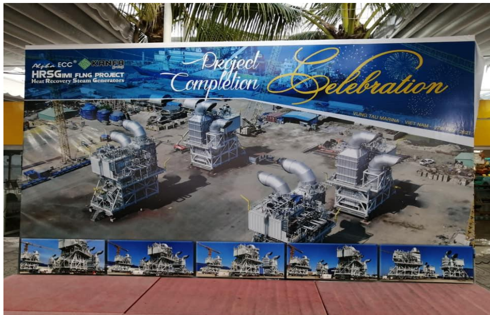
Heat Recovery System Generators modules for FLNG project is