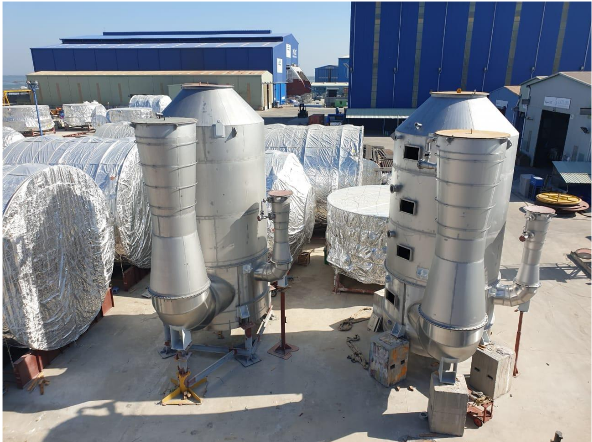
Marine air exhaust cleaning scrubbers from superduplex, imo alloy.